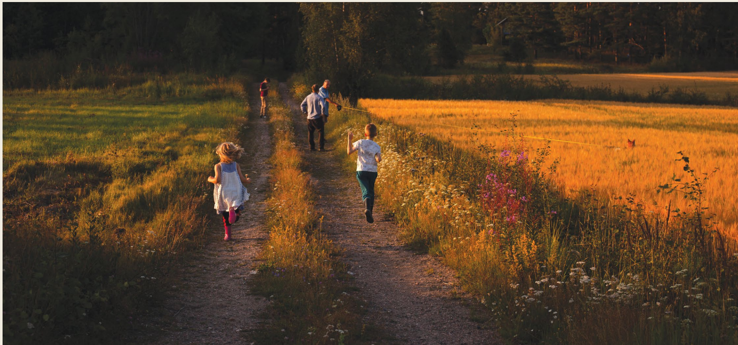
40+ miles of trails and 1,200 acres of preserved land and improved open space