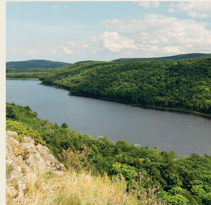
2+ miles of river frontage