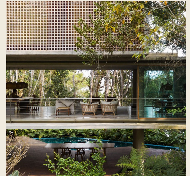
5-star boutique wellness hospitality destination