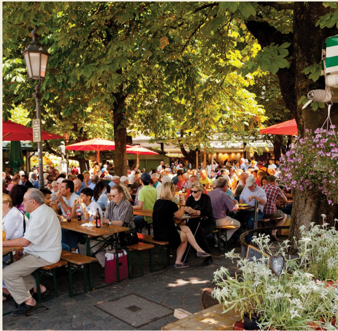
250K+ sq ft of Downtown – a new cultural hub for the region