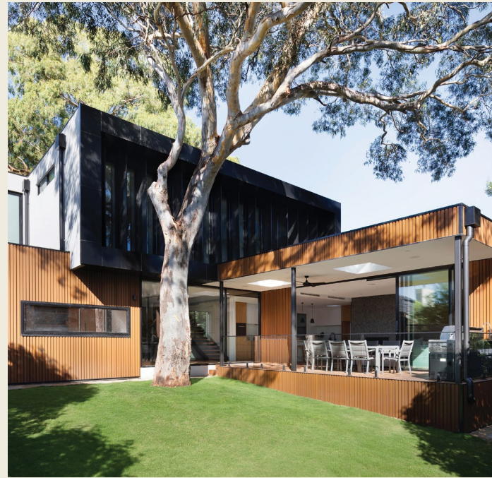
Single-family, multifamily, and active-adult living for 3,500+ residences