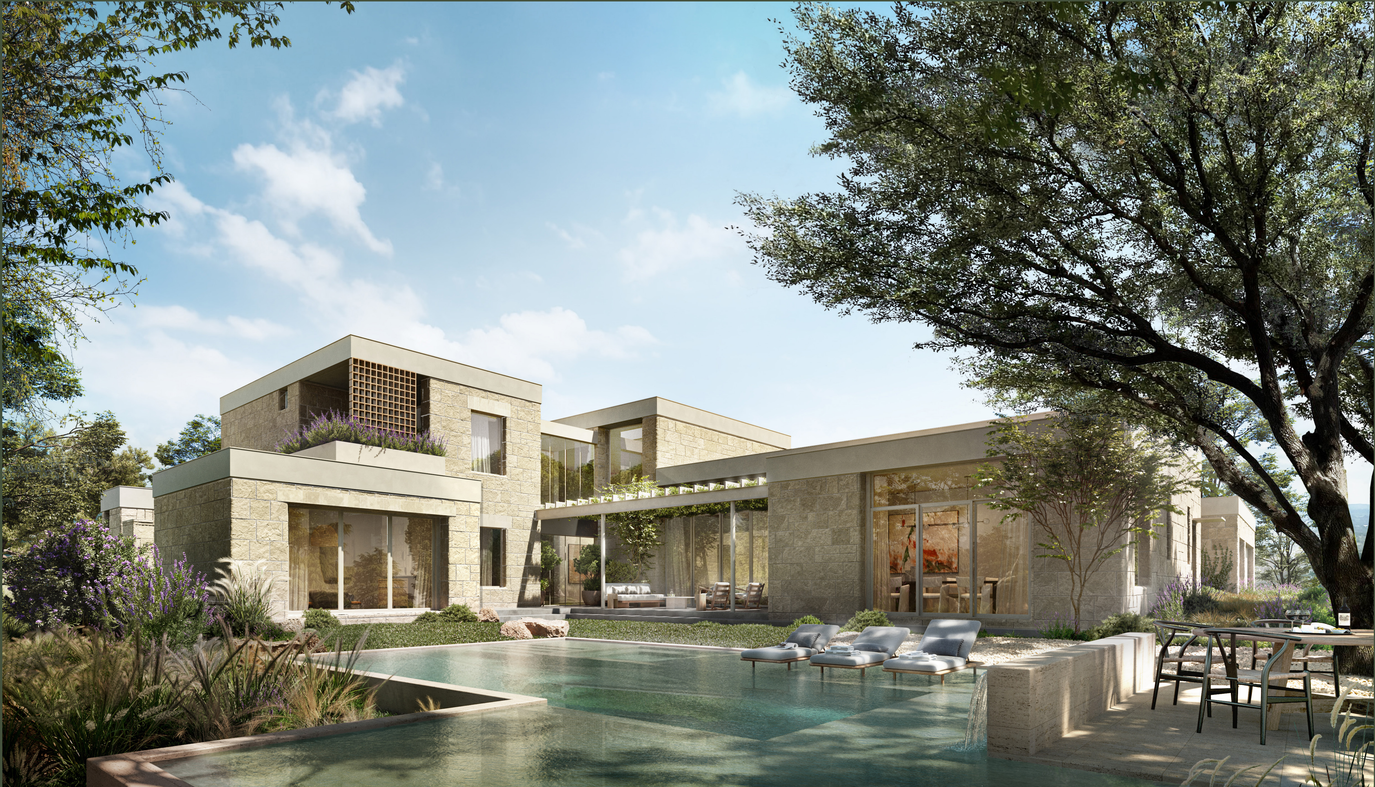
Mayfield Estate Two Story Modern pictured above to show general design intent for Estate Homes.