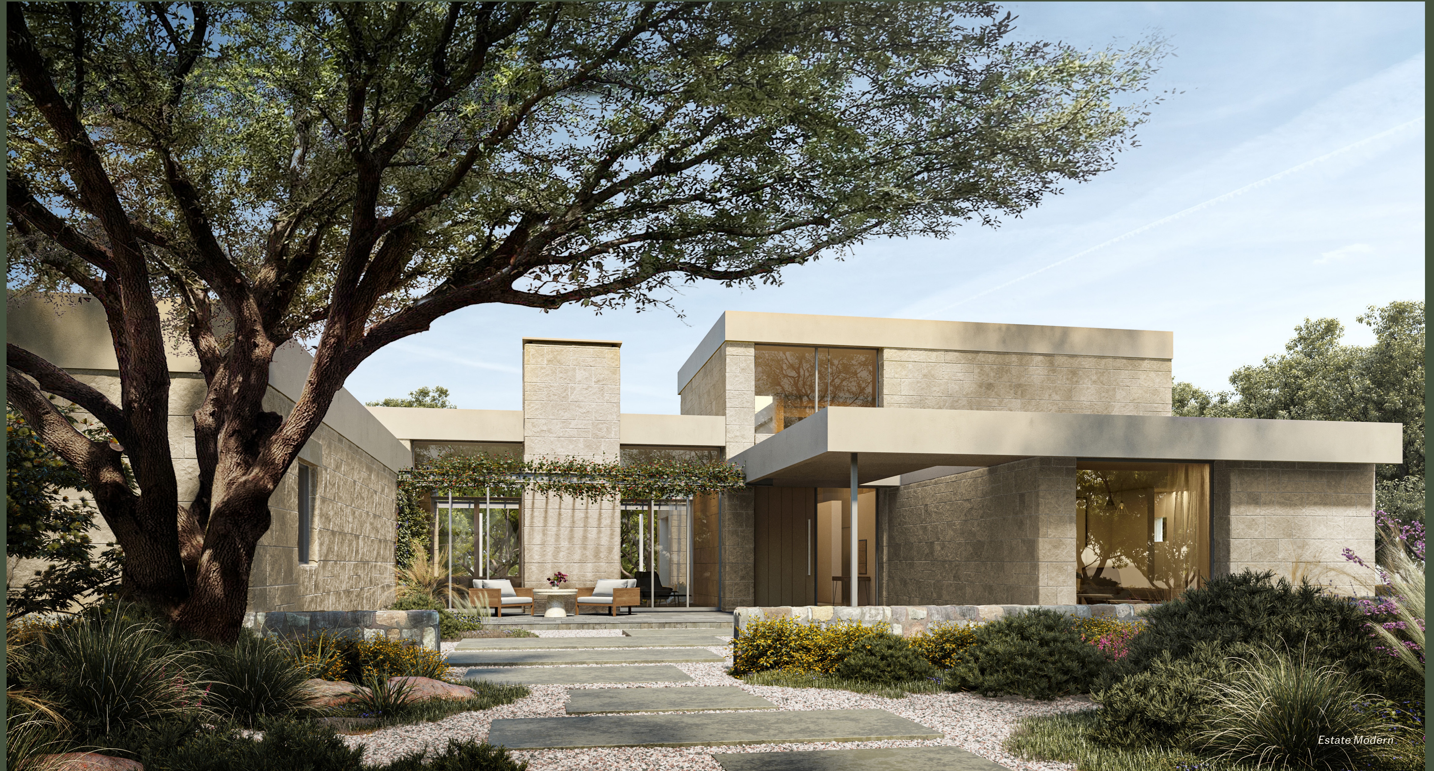
Mayfield Estate Two StoryModern pictured above to show general design intent for Estate Homes.

The Estates provide the highest level of customization among Areté Residences.