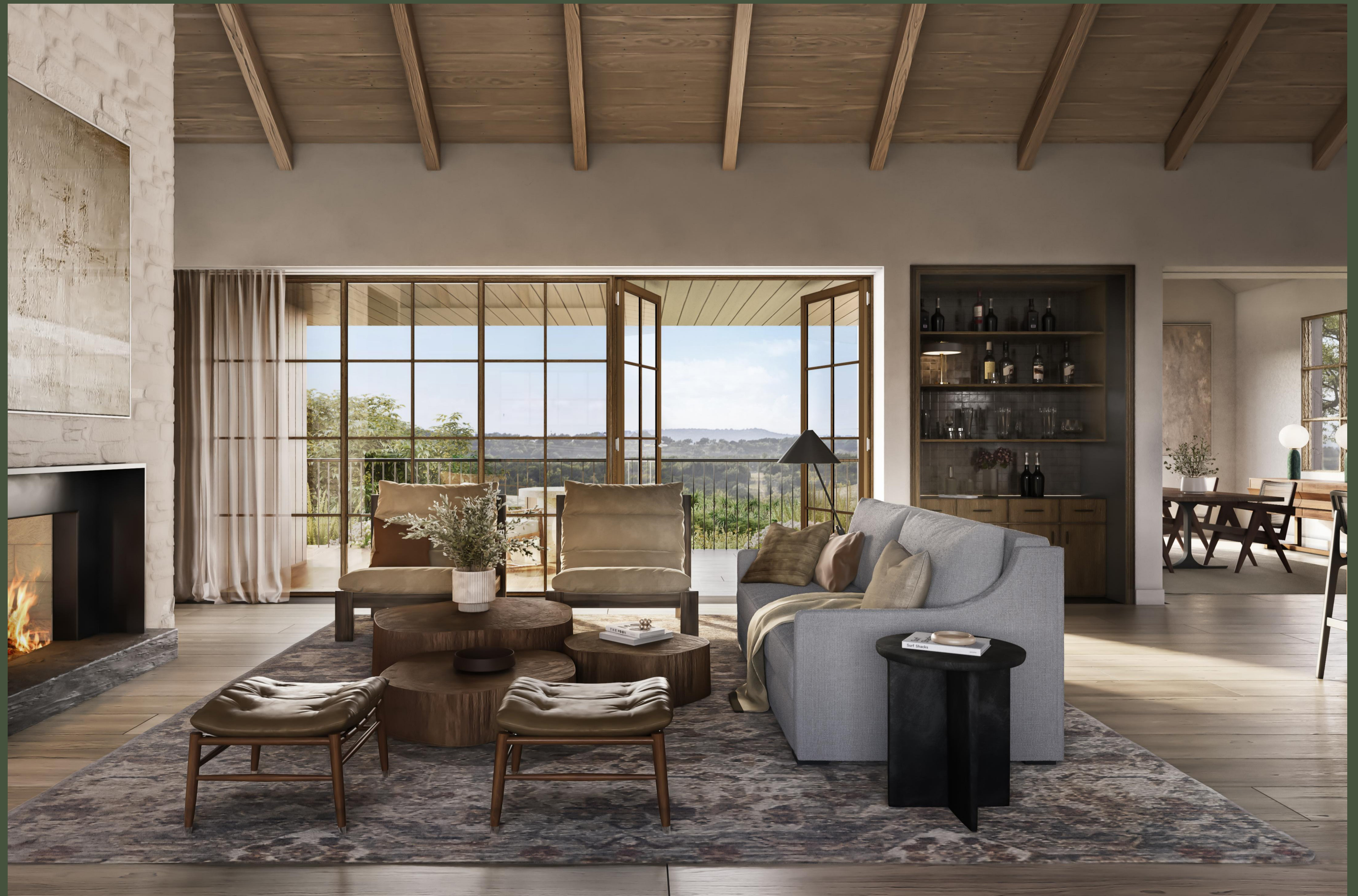
Clark Villa Timeless pictured above to show general design intent for Villa Homes.