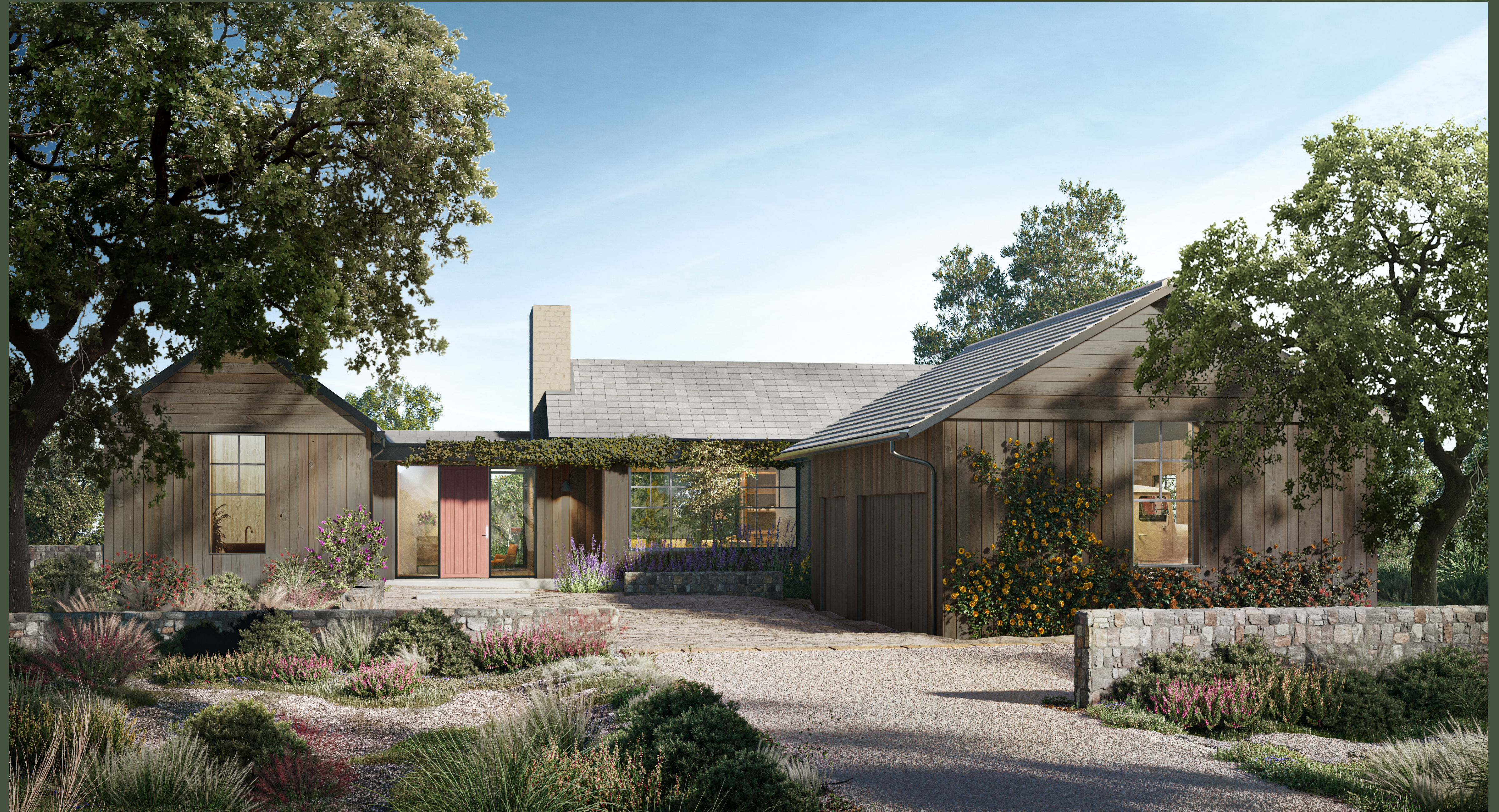
Clark Villa Timeless pictured above to show general design intent for Villa Homes.

The Villa is balanced in aesthetics and approach to working with the land, not against it. Similar to all the other residences in Loraloma, this home boasts stunning views, unique features, and everyday spaces that are elevated with ingenuity and purpose. Each Villa is thoughtfully sited with optimized, protected views and minimal exposure to the sun while still allowing for plenty of natural light. With choices between Modern and Timeless designs, both offer access to all three bedrooms on the main level creating an intentional connection that compliments a variety of family needs and lifestyles. Outdoors, find your own oasis in the beautiful Live Oaks, only a short walk to the amenity-rich campus of Limestone Gulch.