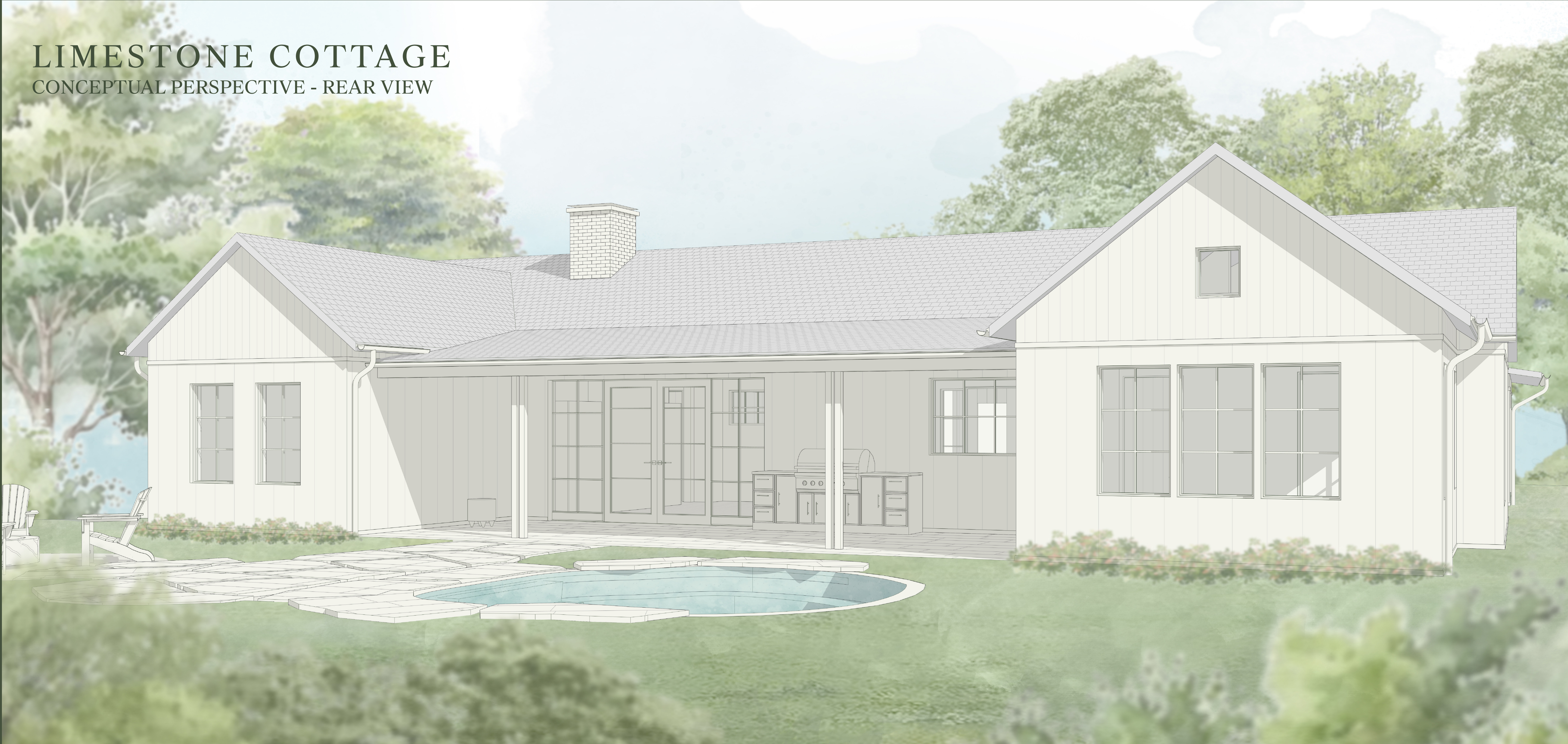
Limestone Cottage Single Story pictured above to show general design intent for Cottage Homes.