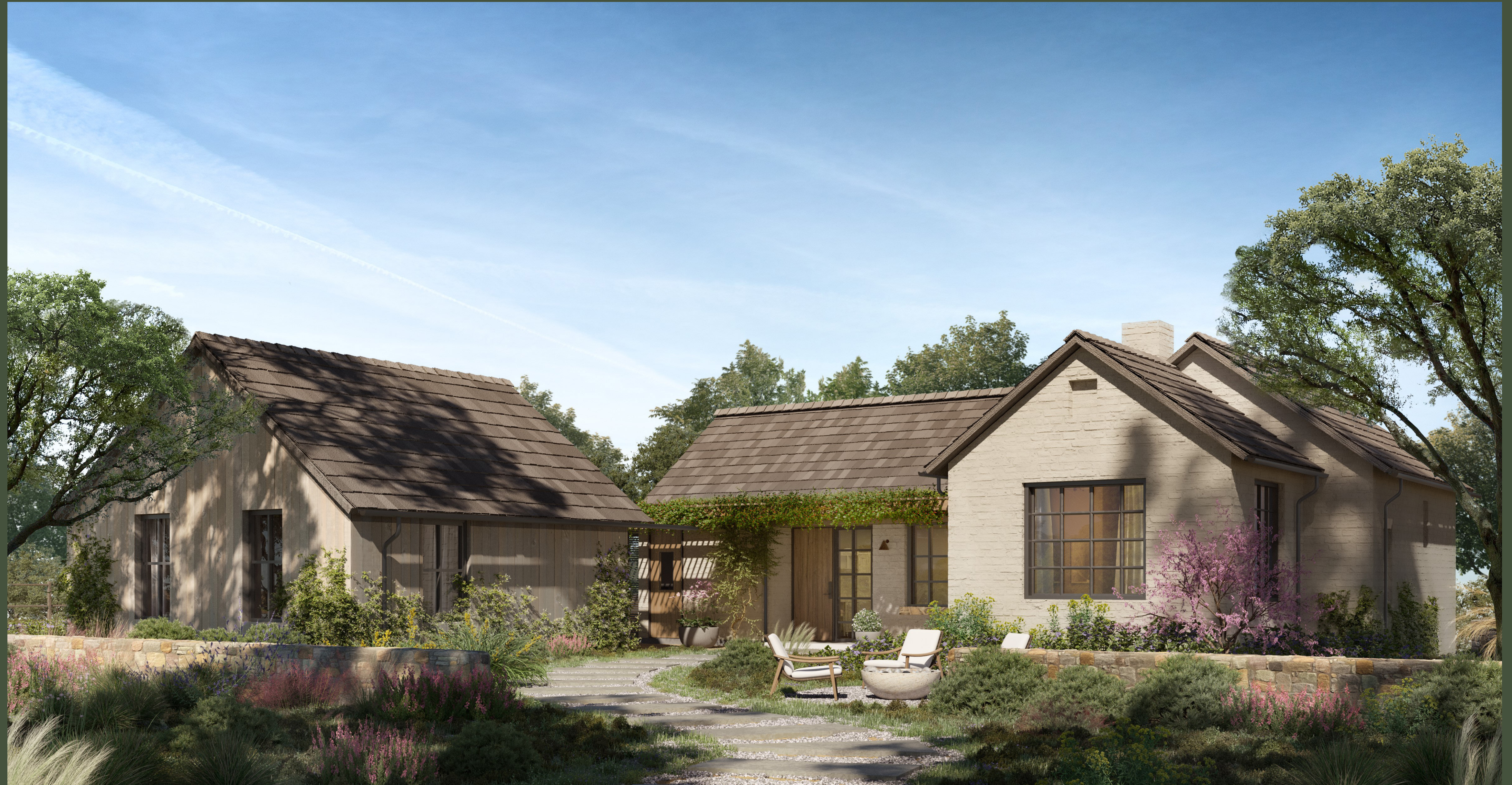
Limestone Cottage pictured above to show general design intent for Cottage Homes.

You will be inspired to live beyond the walls of your home with a plethora of club amenities just beyond your backyard. Whether you're seeking a Sunday home or a year-round residence, the Cottage brings nature to the forefront with protected views of Limestone Gulch and a home discreetly integrated into the natural topography of the land. Thoughtfully placed windows allow natural light to pour in while offering unique views from each area of the home, keeping you connected to nature even while relaxing indoors. Spend your evenings watching the sun go down from the comfort of the cocktail pool or bring your morning coffee on the trail just outside your front door to all that Loraloma has to discover.