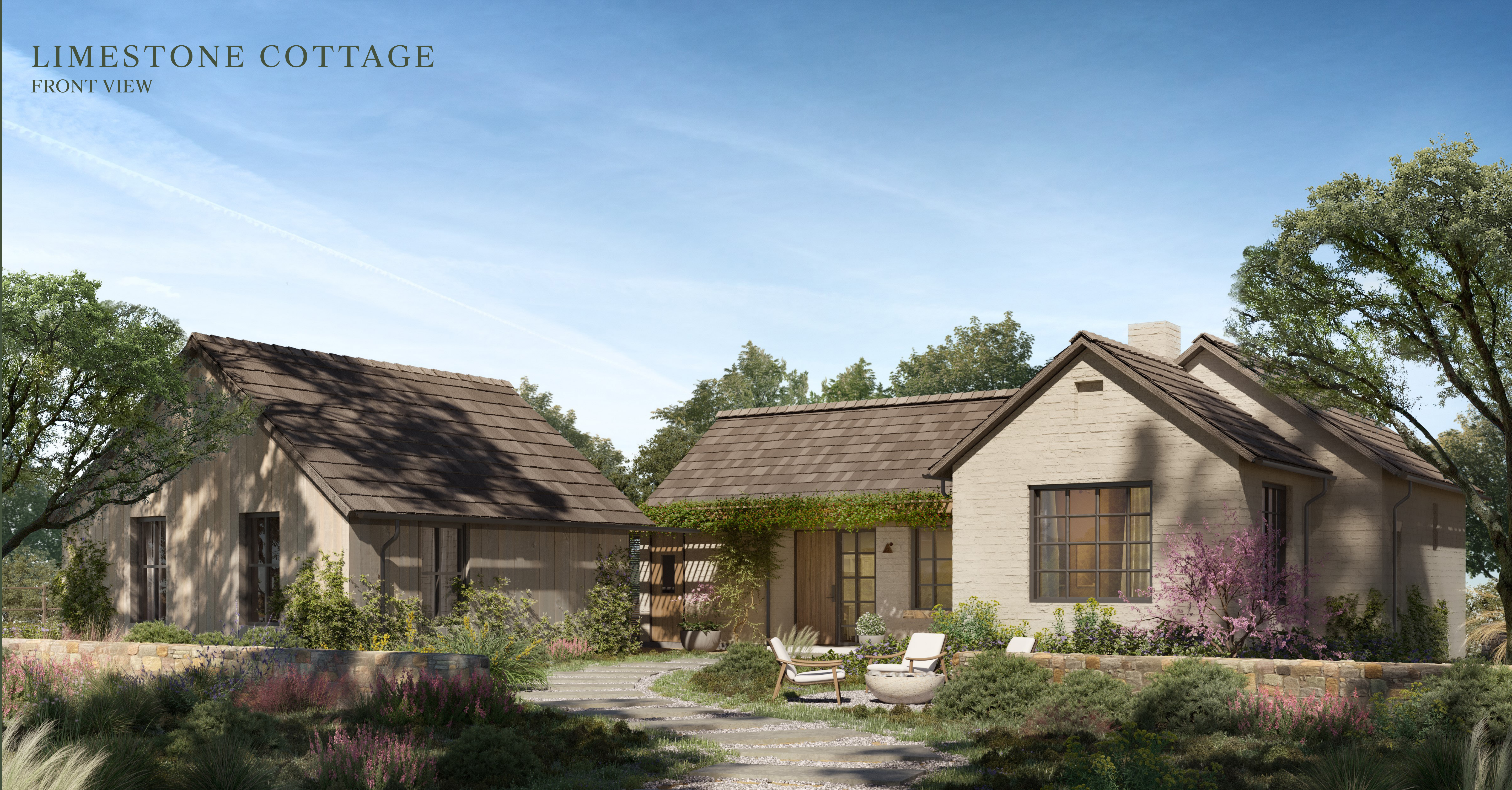
Limestone Cottage Single Story pictured above to show general design intent for Cottage Homes.